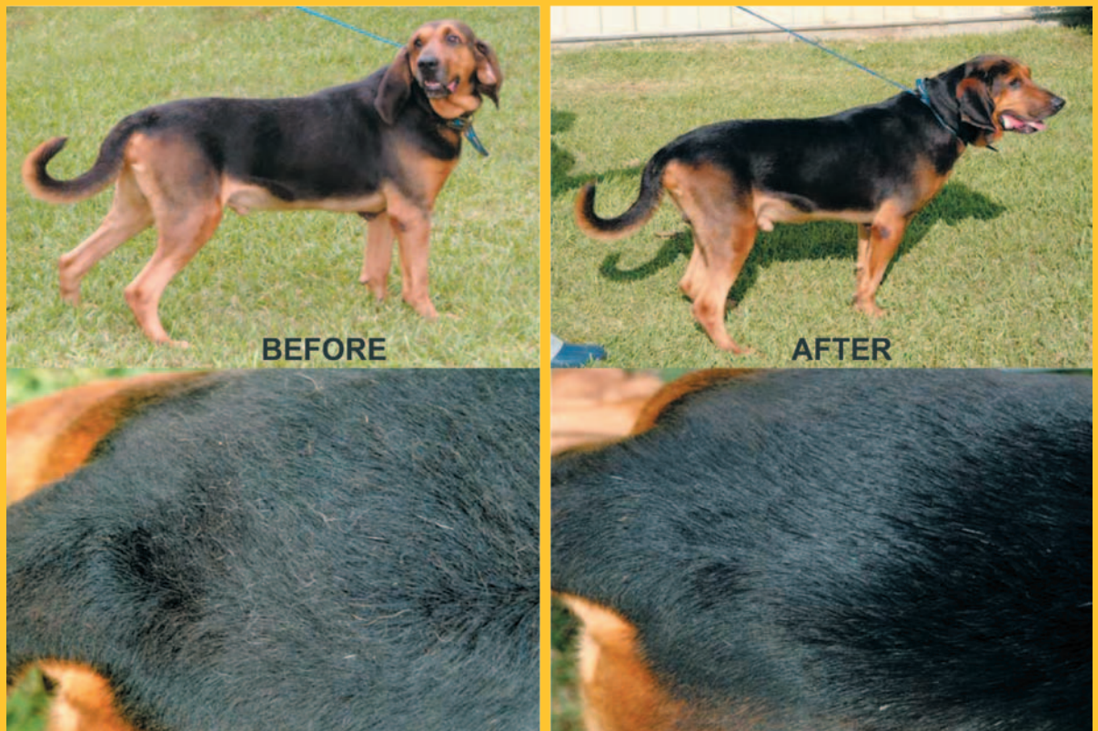
Effect of dietary omega-3, omega-6 plus zinc on skin and hair coat at 12 weeks

Diets containing increased total dietary fat per se also appear to result in improved hair gloss and softness. This effect may be related to increased amounts of cholesteryl ester deposited on the hair shaft surface when high fat diets are fed. Indeed, diets containing increased amounts of total fat are known to result in plasma cholesteryl ester elevations, which may translate into increases in this lipid on the hair shaft. It should be noted, however, that such a modest elevation in cholesteryl ester does not appear to place dogs at risk for coronary artery diseases as affects humans. However, adding additional dietary fat using properly balanced omega-6 and omega-3 polyunsaturated fatty acids in canine diets provides a combination of higher total dietary fat with appropriate amounts of individual omega-3 and omega-6 fatty acids, all of which contribute to optimized lipid nutrition for dogs.